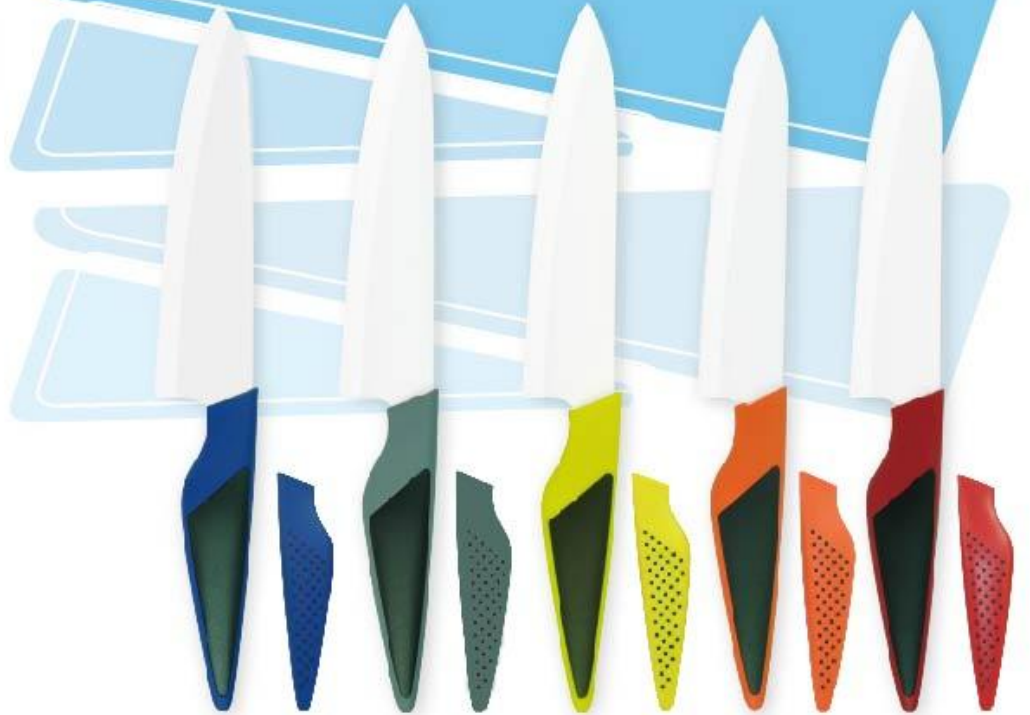
TC-006 /6" Chef