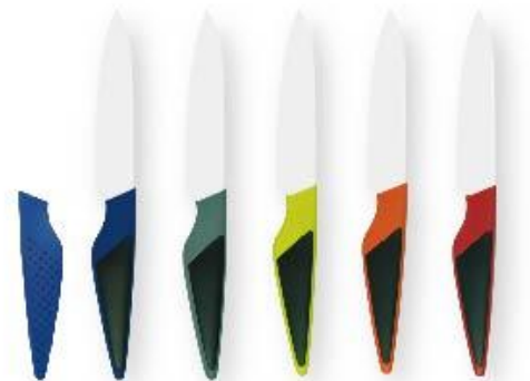
TC-003 /3" Paring