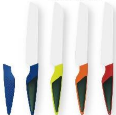
TC-004 /4" Utility