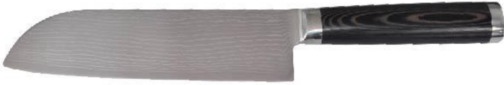
DM-007/7" Chef knife